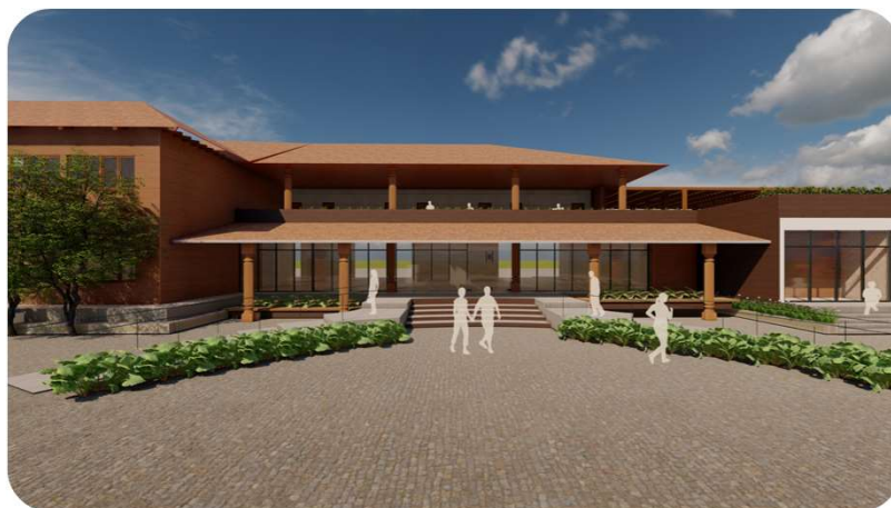
Mid Range Hotel